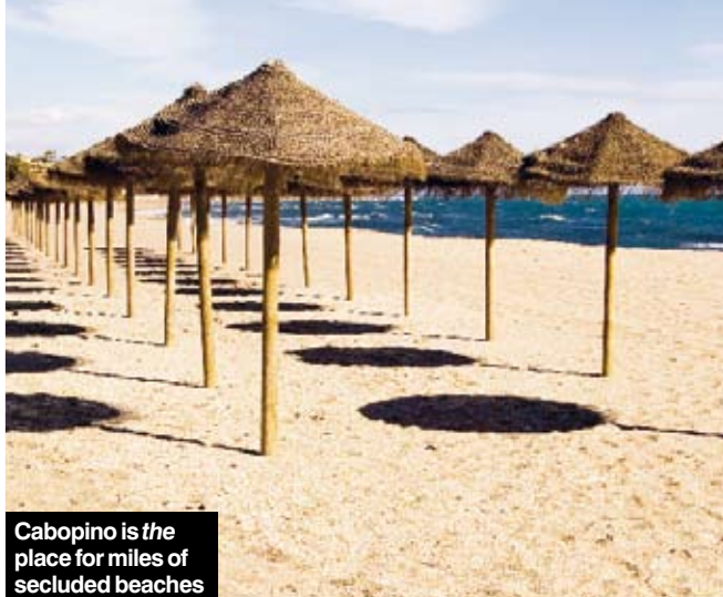
Cabopino is the place for miles of secluded beaches