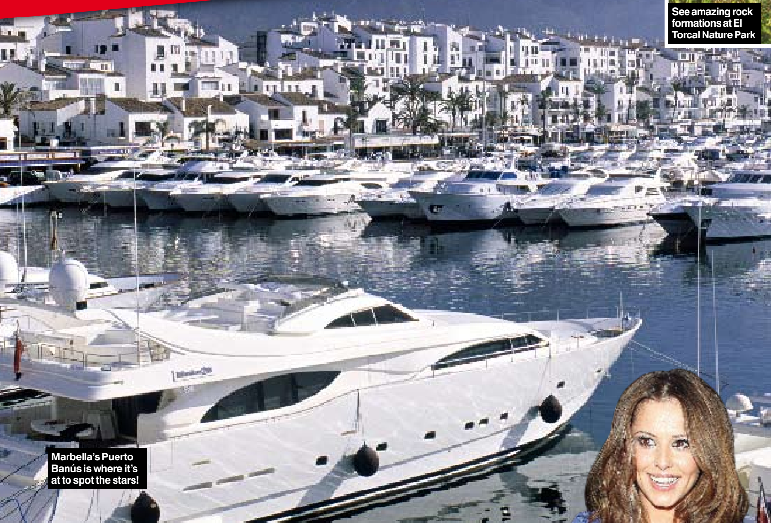
Marbella's Puerto Banús is where it's at to spot the stars!

W ith mile after mile of golden sandy beaches, glamorous nightlife and guaranteed sunshine, Spain's Costa Del Sol has always been the ideal destination for all age-groups. Whether you want to catch some rays by day and party by night, pack in some culture or simply get away from it all, the region has plenty to offer – and, what's more, it takes just a couple of hours to fly there. Now, you can even achieve a perfect bikini body on your trip, as a number of boot