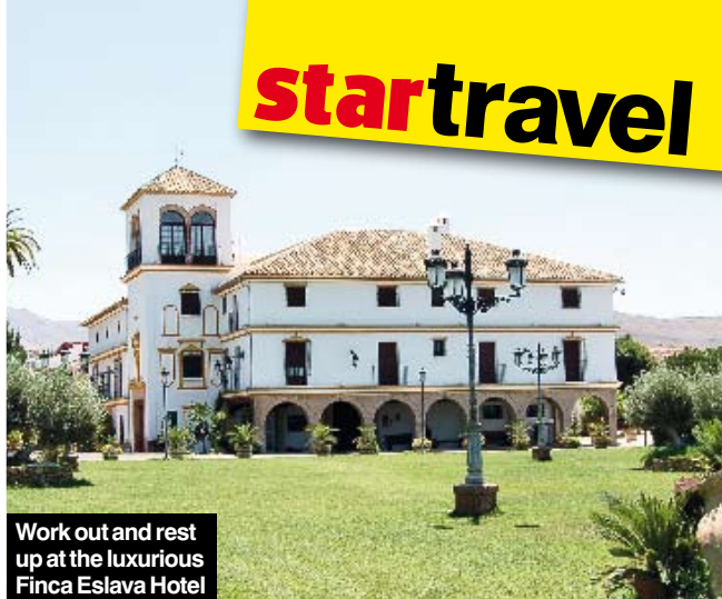
Work out and rest up at the luxurious Finca Eslava Hotel